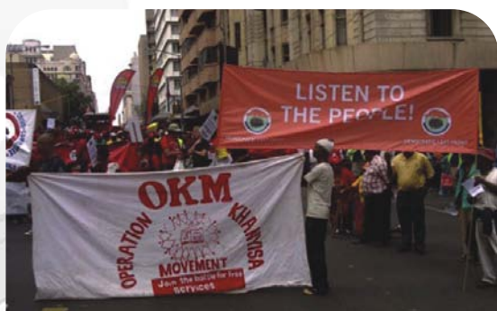
COSATU National Strike Against E-tolls and Labour Brokers

“The union movement all over the world is feeling the squeeze from three decades of neoliberal restructuring and now the global crisis. High levels of structural unemployment, fragmented labour markets and austerity measures have all conspired to place labour in a difficult place.